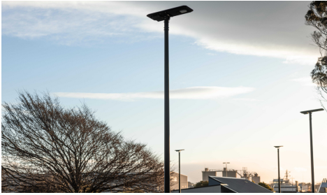
Tarleton St East Devonport 1