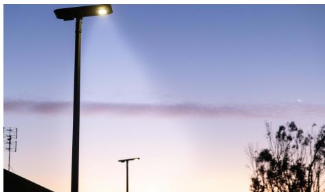
Tarleton St East Devonport 9