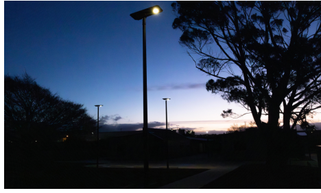
Tarleton St East Devonport 7