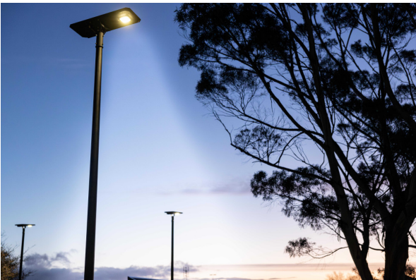
Tarleton St East Devonport 11