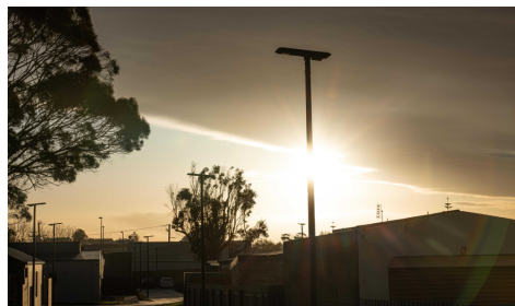
Tarleton St East Devonport 2