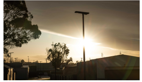
Tarleton St East Devonport 2