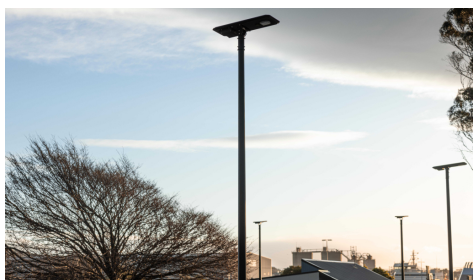
Tarleton St East Devonport 1