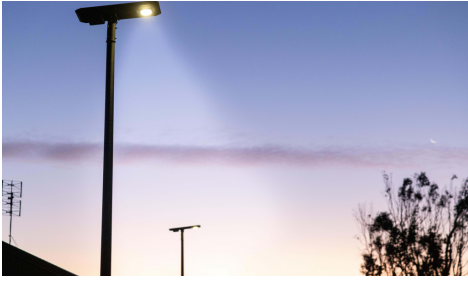
Tarleton St East Devonport 9