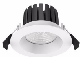
EMPRESS 15W Recessed Fixed Downlight