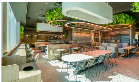
Hungry Jacks T1 Melbourne Airport 3