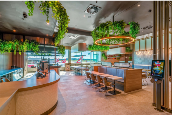
Hungry Jacks T1 Melbourne Airport 17