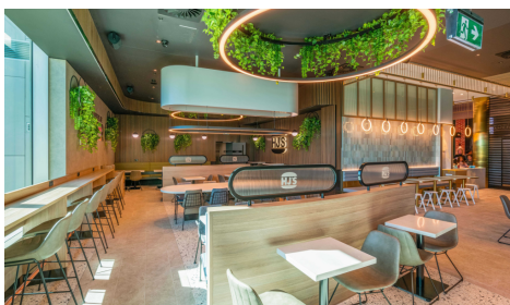
Hungry Jacks T1 Melbourne Airport 1