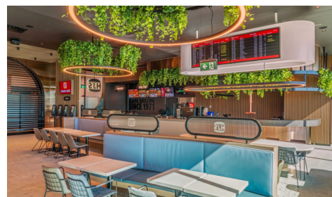
Hungry Jacks T1 Melbourne Airport 33