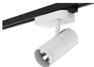
ALPHA-S 13W Adjustable Tracklight