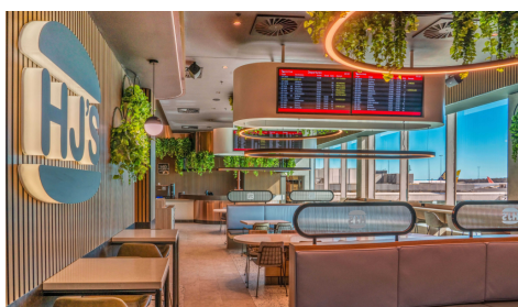
Hungry Jacks T1 Melbourne Airport 30