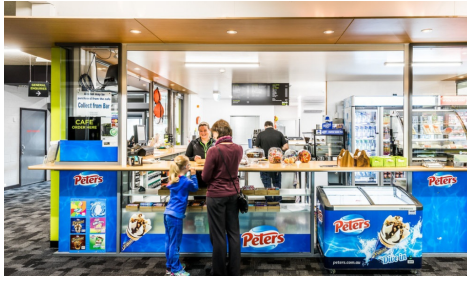
Aka Kingborough Storts Centre 2018 30