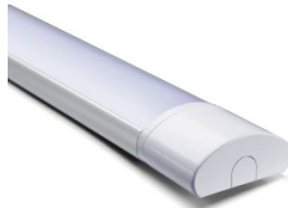
CADE 20W 600mm Surface Mount Batten