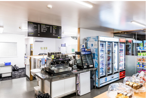
Aka Kingborough Storts Centre 2018 33