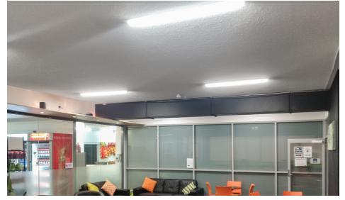
Kingborough Sports Complex 22