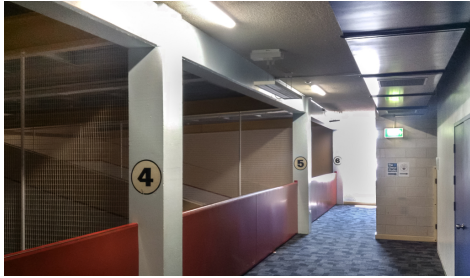
Kingborough Sports Complex 3