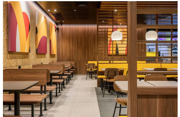
Mc Donalds Endinburgh 5