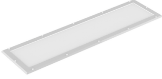
BURNET 40W Cleanroom Panel Light, IP54, 1237x337