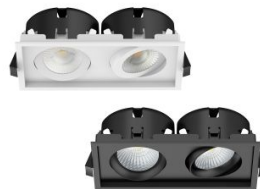
WALTZ 20W Rectangle Downlight