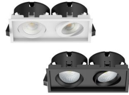
WALTZ 20W Rectangle Downlight