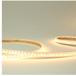
INFINITY 10W LED Strip Light CRI95