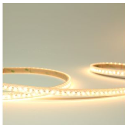
INFINITY 10W LED Strip Light CRI95