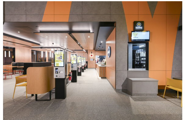
Mc Donalds Hallam Rd Hampton Park 6