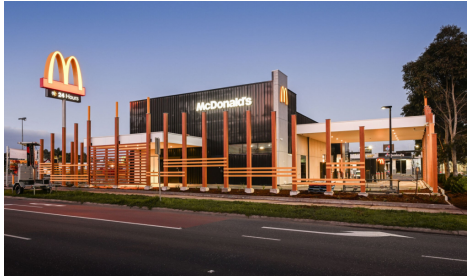
Mc Donalds Hallam Rd Hampton Park 2