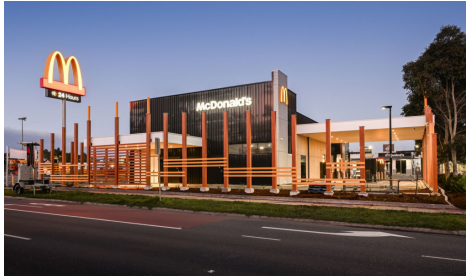
Mc Donalds Hallam Rd Hampton Park 2