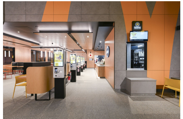
Mc Donalds Hallam Rd Hampton Park 6