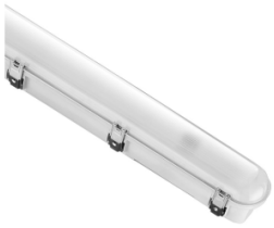
TITAN 45W Weatherproof Batten 1220mm