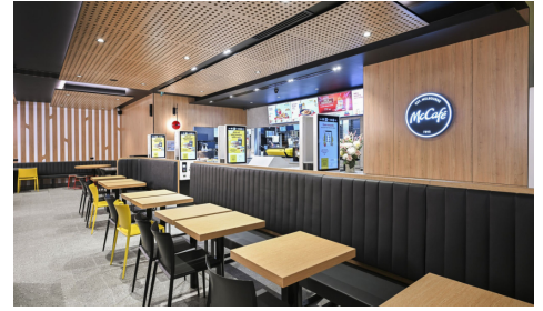
Mc Donalds Hallam Rd Hampton Park 3