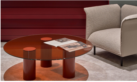
Unispace Mitsui 1123 Ir