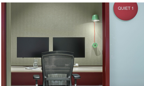
Unispace Mitsui 1086 Ir