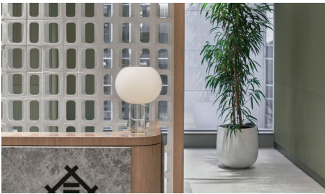
Unispace Mitsui 1040 Ir