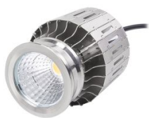
NEO M14 13W LED Downlight Module