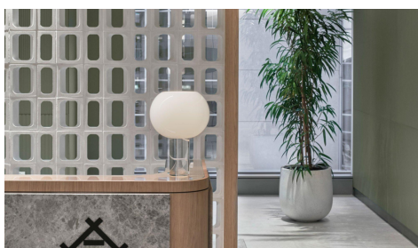
Unispace Mitsui 1040 Ir