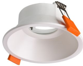
NEO K1.0 Recessed Mount Ring