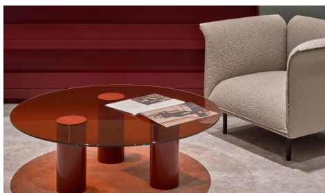
Unispace Mitsui 1123 Ir