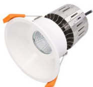
NEO K1.0 Recessed Downlight Trim