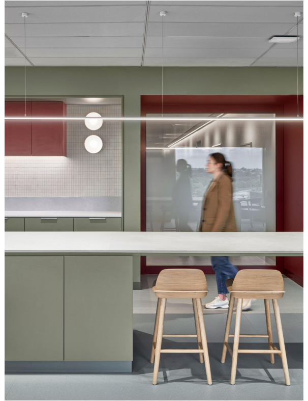
Unispace Mitsui 0592 Ir