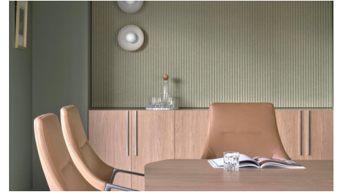
Unispace Mitsui 1067 Ir