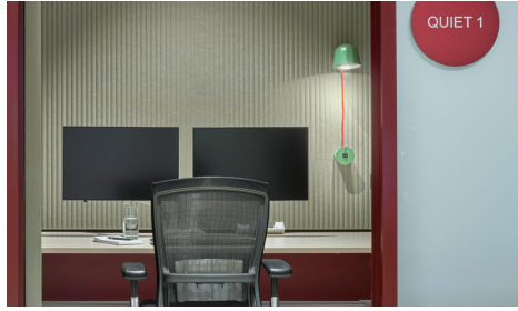
Unispace Mitsui 1086 Ir