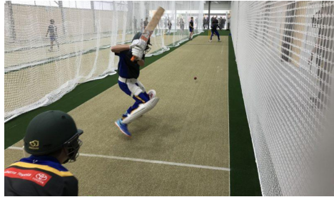
Cricket Nets in Use