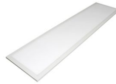
BLAIZE 30W Rectangle Panel Light 1200x300