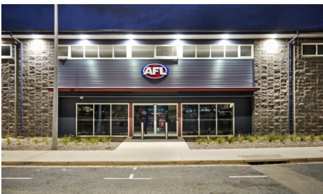
Afl Pavilion Canberra 11