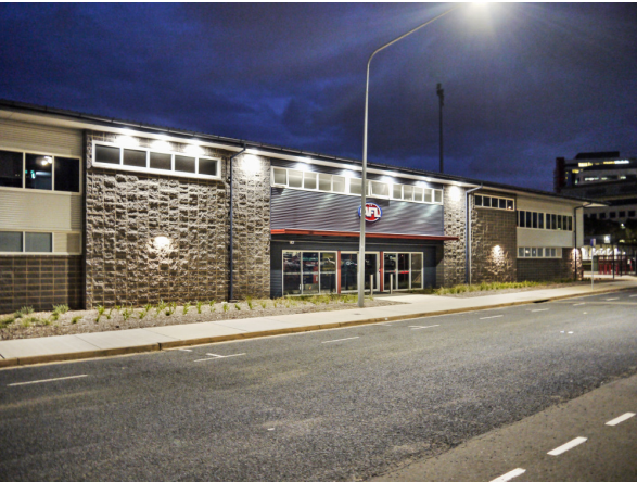
Afl Pavilion Canberra 3