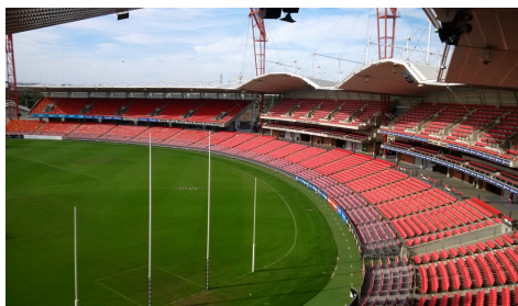
Spotless Stadium Sydney Olympic Park Sydney Showgrounds 40