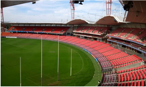
Spotless Stadium Sydney Olympic Park Sydney Showgrounds 40