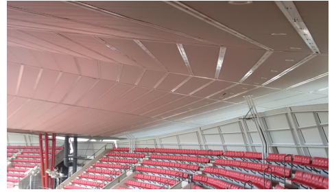
Spotless Stadium Sydney Olympic Park Sydney Showgrounds 39