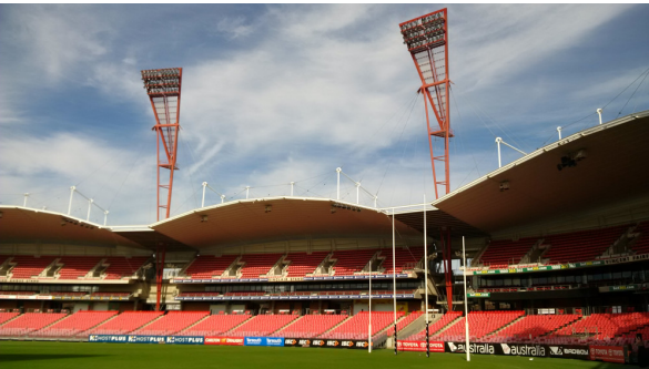
Spotless Stadium Sydney Olympic Park Sydney Showgrounds 23