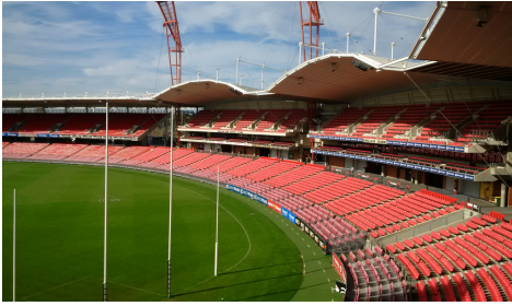
Spotless Stadium Sydney Olympic Park Sydney Showgrounds 28