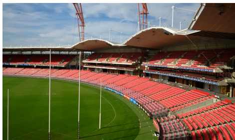
Spotless Stadium Sydney Olympic Park Sydney Showgrounds 28