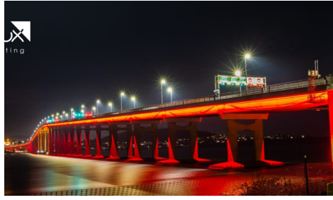
Tasman Bridge 02