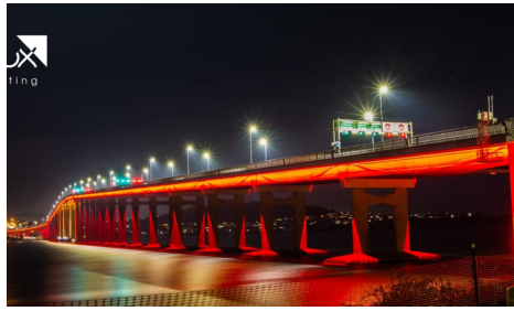
Tasman Bridge 02