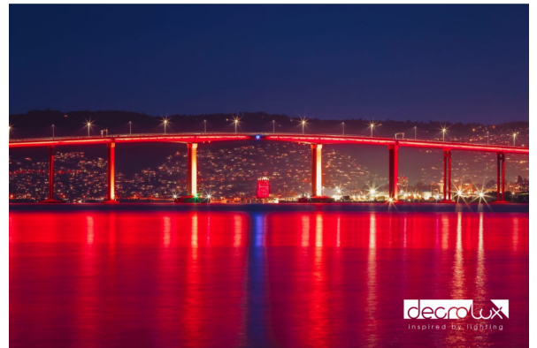
Tasman Bridge 1